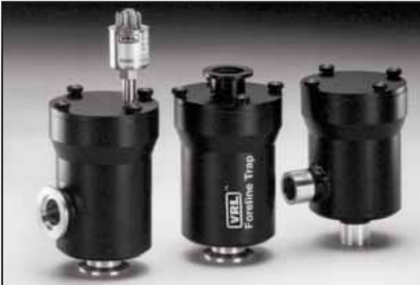
Left to right: Angle style with optional Pirani/TC tube, Inline style trap with NW-25, Angle style with 1 inch hose connections