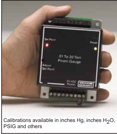
Calibrations available in inches Hg, inches H 2 O, PSIG and others

Vacuum and Pressure Atmospheric pressure as reference, reads zero at atmosphere. Choose Any Unit Calibration in PSIG, in. Hg, In. H 2 O, mm Hg. Choose Any Range Some standard ranges are shown below, but any range is available. Best Value Gauges Although low in cost these rugged instruments include all the features you need. Adjustable set point, analog output and more. Diaphragm Sensors are available with any flange style: NW, NPT, VCR, VCO, etc. Digital Display (optional) 3 1/2 place LCD gives high resolution over entire gauge range. Millisecond Response for Alarm Built in relay and set point provide msec. response for alarm; adjustable relay does not have to wait for slow scanning data systems. Cable Length to 500 feet Add or change the cable length between sensor and gauge up to 500 Ft. (150m) No affect on calibration. Control or Alarm These gauges provides an inexpensive and straightforward way to control your vacuum system. Use the adjustable set point with built-in relay to control backfill pressure on pump and purge operations. Or, feed the Fast Response analog output into your PC or PLC and let the digital system make the control decisions based on the signal.