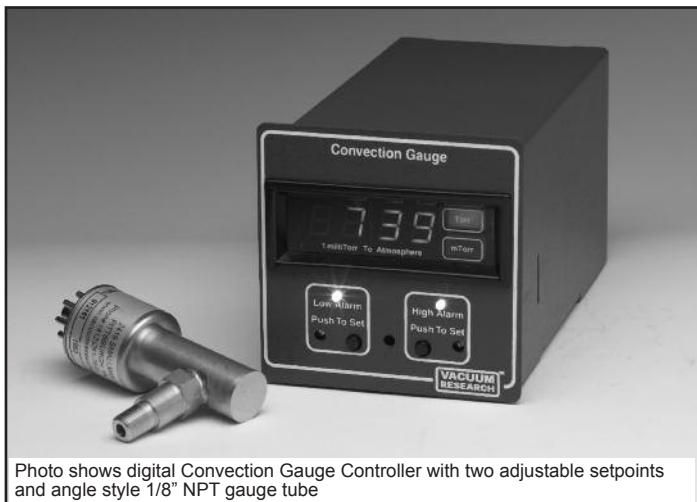
Photo shows digital Convection Gauge Controller with two adjustable setpoints and angle style 1/8" NPT gauge tube