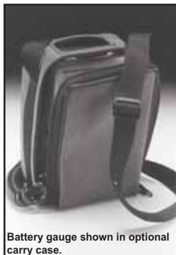
Battery gauge shown in optional carry case.