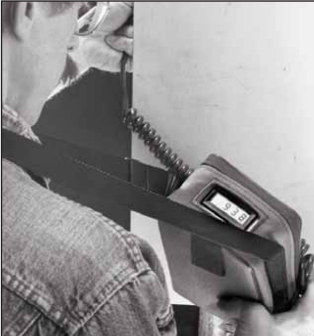
Display is visible with optional water-resistant carry case fully closed.